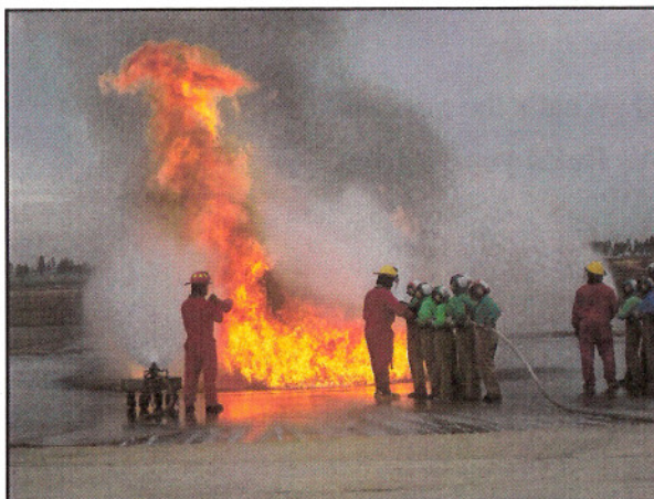
Kicking Butt at Lemoore firefighting school